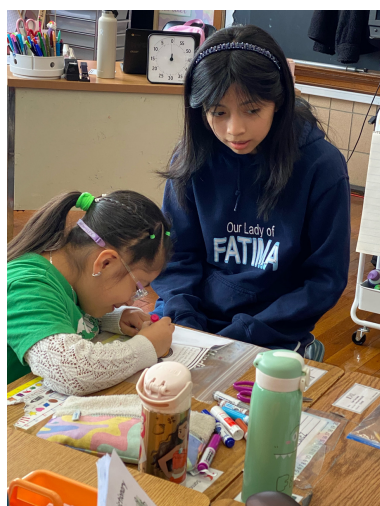
8th graders visited Kindergarten & 1st grade to work on a Psalm Sunday activity.