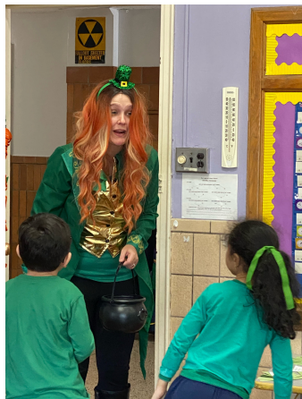
Classes were visited by the Leprechaun on Monday in honor of St. Patrick's Day.